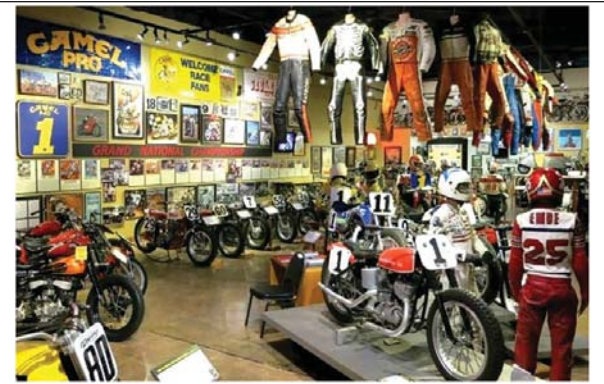
Leathers from many GNC champs are on display, plus over 100 pieces of art; posters, prints, even original oil paintings.