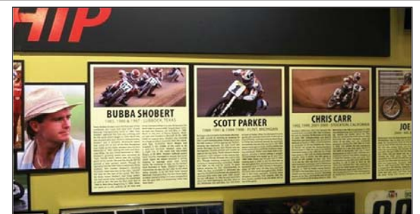
Since the Grand National Championship rules were instituted by the AMA in 1954, about 25 champions have been crowned. You can learn about the careers of each #1 rider through these detailed biographical panels.