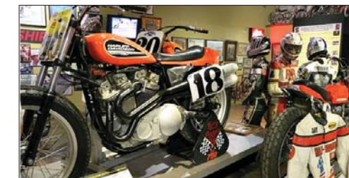
A fully restored Terry Poovey Harley-Davidson XR750 sits next to Jay Springsteen's multi-race winning MX250-based Harley short track racer.