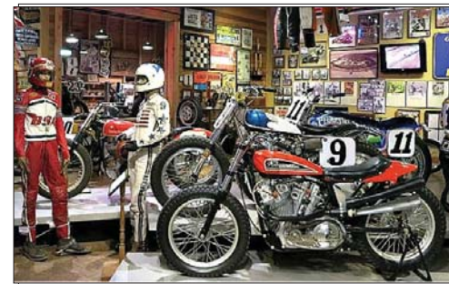
Racing leathers from Don Emde, Gary Nixon and Kenny Roberts frame a Bart Markel KR750, Nixon's last Triumph dirt tracker and a full cutaway of the legendary Harley-Davidson XR750 on loan from the Harley-Davidson Museum.

This temporary exhibit, on display through April 2014 only occupies about five percent of the space in the National Motorcycle Museum. The Museum is open every day 9:00 am - 5:00 pm, year around. The website will help you plan a trip; www.nationalmcmuseum.org. Or call for more information, 319 462 3925.