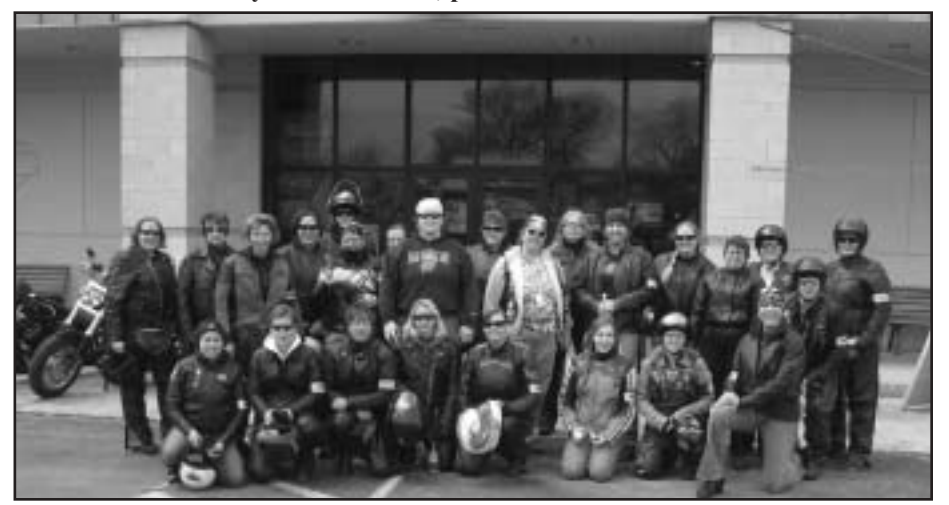
Hal's Group for Women's Ride