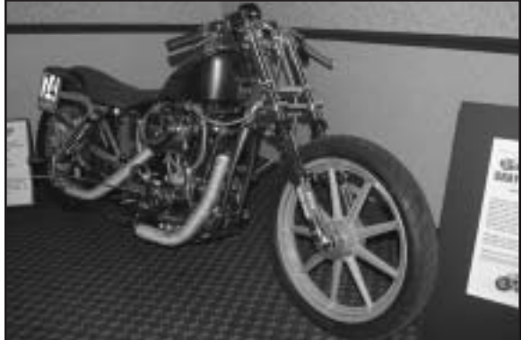
all-numbers-matching 1974 Harley-Davidson Sportster XLH, which was purchased three years ago as a basket case and brought back to life as the "Gray Ghost" Project.

BEST MOTORCYCLING SECRETS 19 tours covering