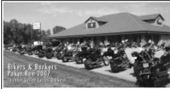
Bikers & Barkers Poker Run 2007 Thunder Valley Cycles Oshkosh

If interested in adopting a pet (or surrendering one) please call 902-424-2128 or visit website, oahs.org.