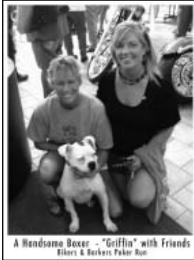
A Handsome Boxer - "Griffin" with Friends Bikers & Barkers Poker Run