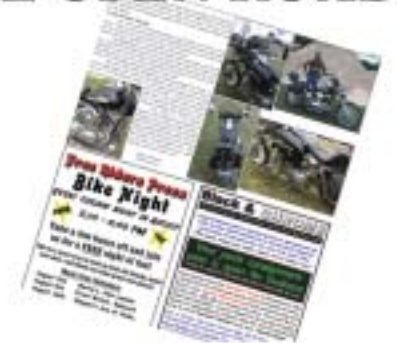
Free Riders Press Bike Nights