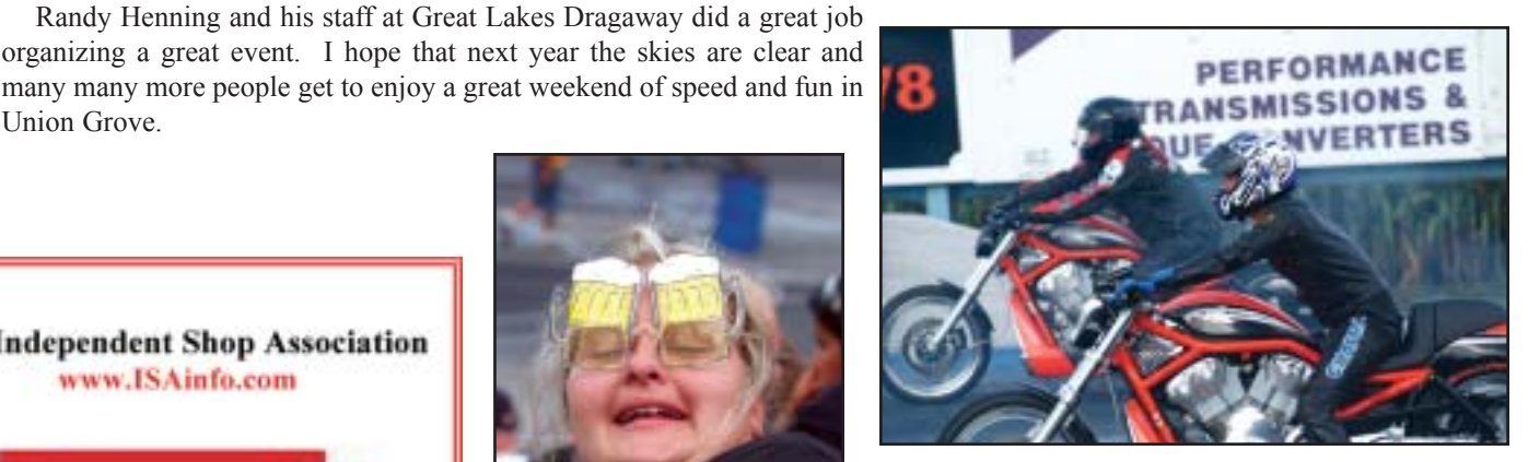
At the Line: Racers in matching V-Rods roll up to the starting line.

Off the line: Racers sprint from the starting line