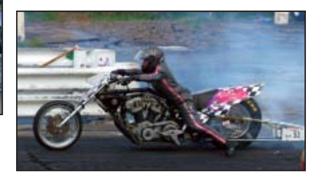
Warm up: Who says Girls can't race?