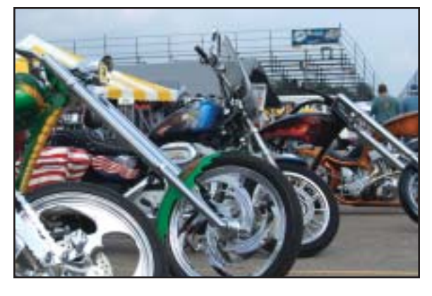
Bikeshow: Some of the impressive rides brought in for the 2-day bike show.