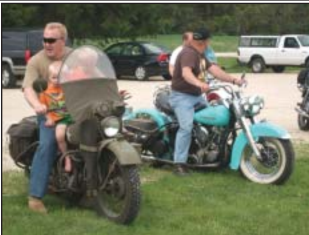
Young trainees aboard a WWII military Harley.

For more information about the Badger Heritage Chapter, AMCA write to: Badger Heritage Chapter, N88 W17143 Main St., Menomonee Falls, WI 53051 or call (414) 251-4131