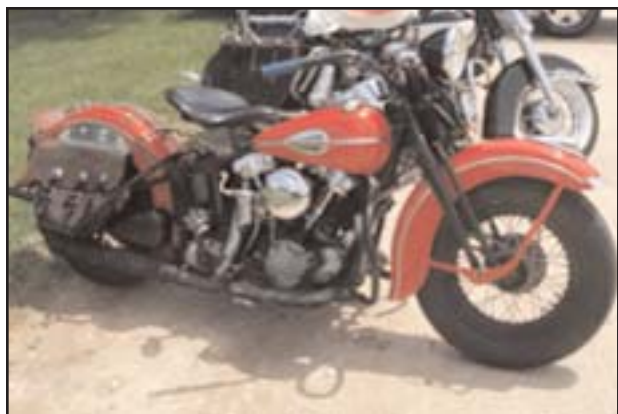
Vintage Harleys were the most popular in terms of numbers at the meet.