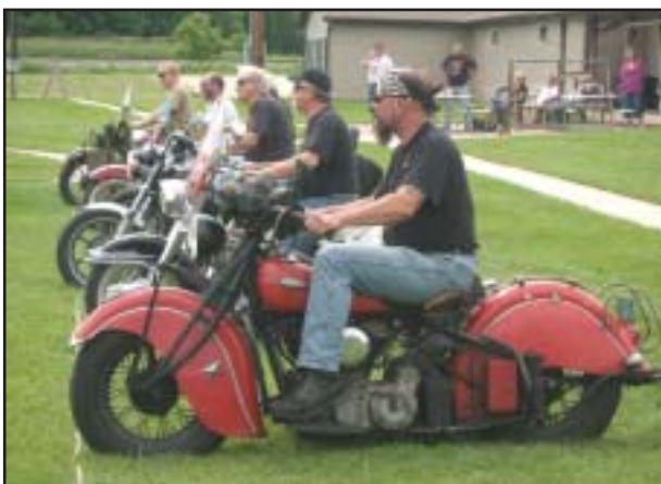
1940 Indian Chief seems to be winning the slow race.