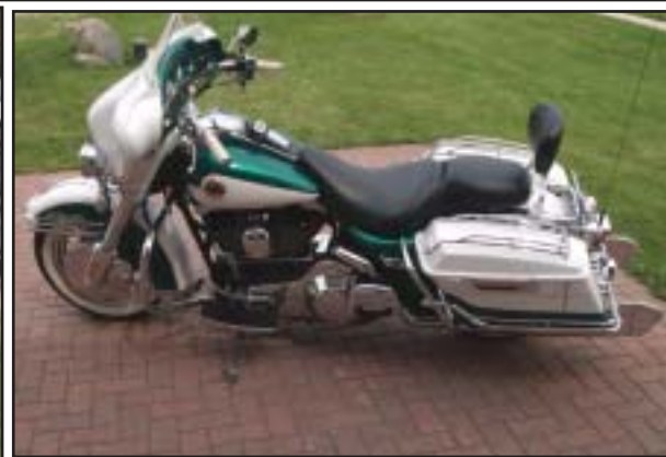
There's nothing out of date about a classic like this one.