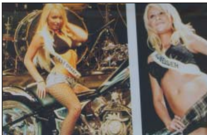
Miss East Coast Choppers & Miss Budweiser

work 2011, 2 four hour shifts at Main & 4th St. 1 block from Gator H-D main stage in Towne Square. This was the 1st year Budweiser sponsored O-Cartz's as a shuttle service to downtown for folk so they didn't have to walk a mile or better for tips to the driver. There were 56 bands for the largest 3 day bike event in the U.S. You can walk around the 30 blocks with a beer or mixed drink and Not Go To Jail.