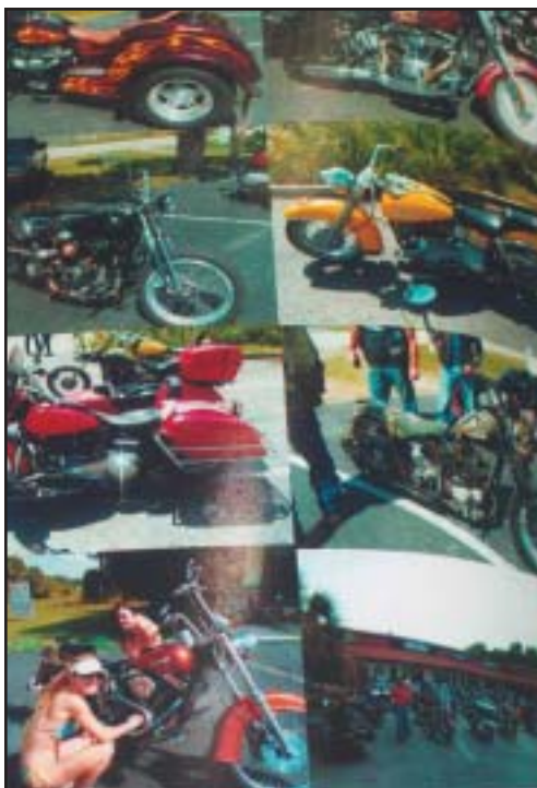
Bikes at the bike show..

show with classes and tons of bike events to enter. 30 city blocks with Road Crew folk to make sure downtown Leesburg is motorcycle parkin' and traffic only for 3 days and nights. The 15th Annual Leesburg Bikefest was in Memory of Brother "David Ough" that ate, drank, worked the biker lifestyle. For 14 years "Dave O" got scooter folk to volunteer. Some of their party time to do 4 hr shifts all over the