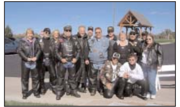
Representatives from the three Rolling Thunder® Chapters in WI at the Ceremony.