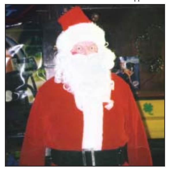
Every toy run has a Santa