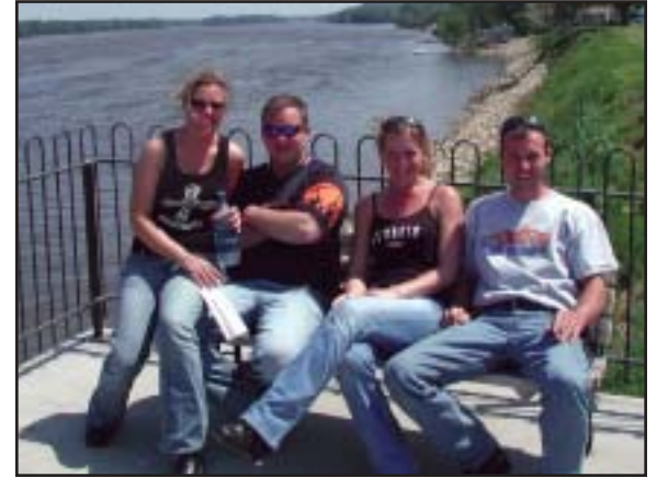
Relaxing in Dubuque