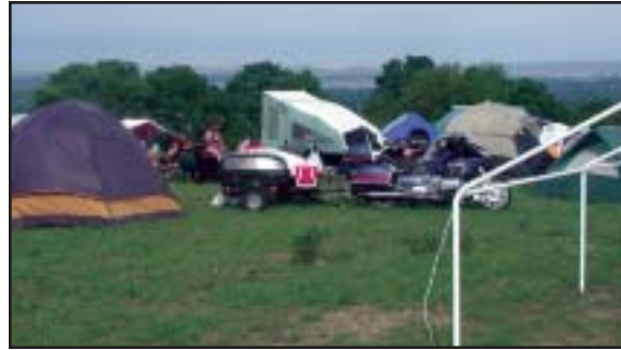
The view is Breathtaking