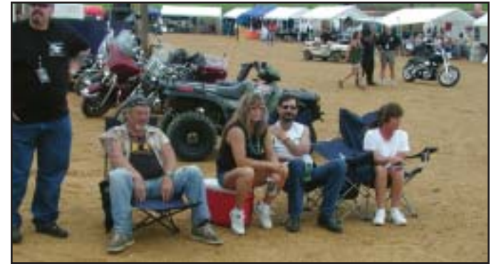
Waiting for the show