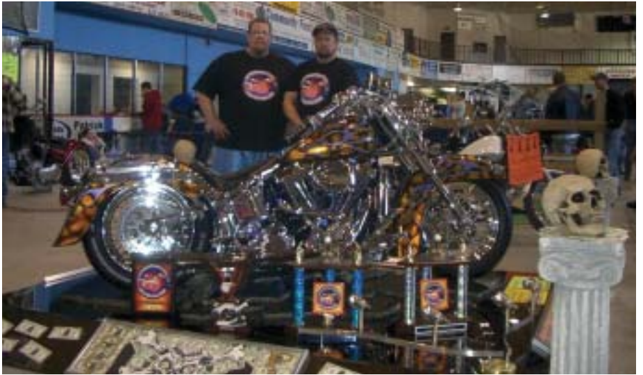
A real show stopper