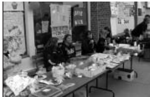
Lots of goodies to eat.