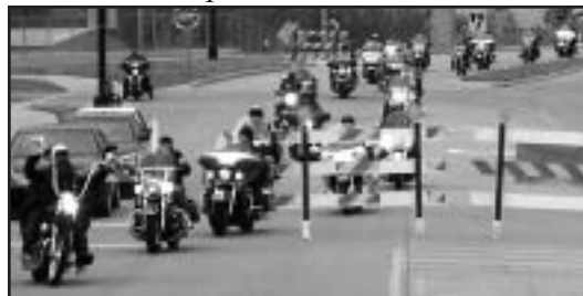
A group arrives from Milwaukee for the May Day Blood Run.

This years May Day Blood Drive is May 3rd 9am-4:30 pm