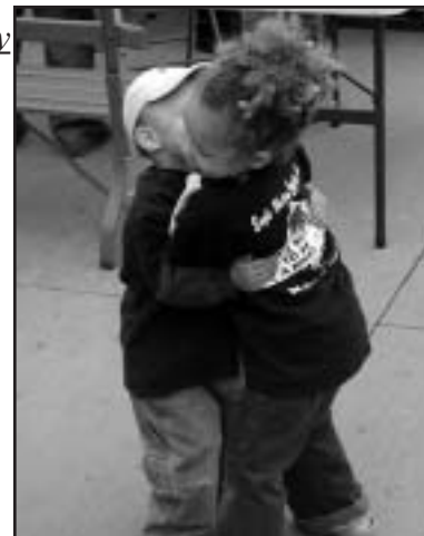
Can't we all just get along?