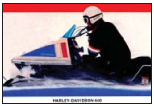
'73 Harley Davidson