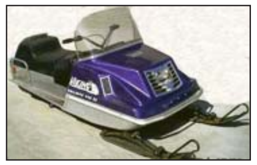
Preacher's sled while growing up in Wisconsin Winter's '74 Viking