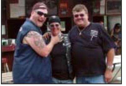
Yep, Big Schwag was there.