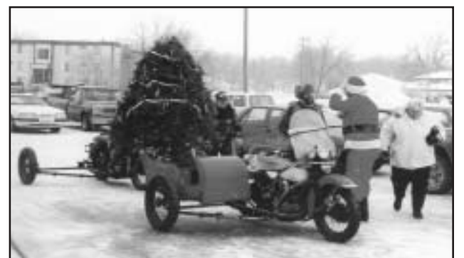
President Sioux Falls at the annual toy run