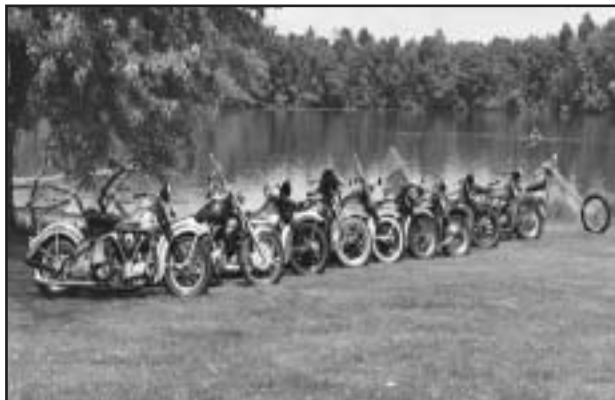
Now that's a pretty site!