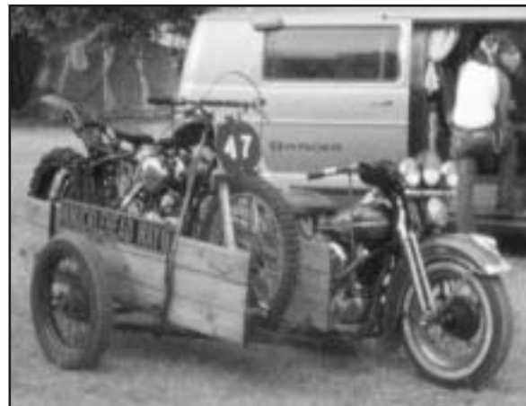
Now that's how to haul a bike!