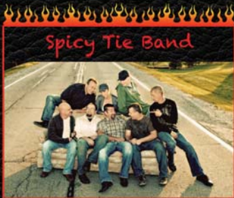
Spicy Tie Band

RIDE FOR A CAUSE FOR LAKELAND AREA SPECIAL OLYMPICS $1,000 IN CASH AND PRIZES ALL BIKES WELCOME TO JOIN IN THE FUN FUN RUNS ON OUTRAGEOUS BACK ROADS FREE LIVE MUSIC FRI. & SAT. JUNE 14 & 15, 2013