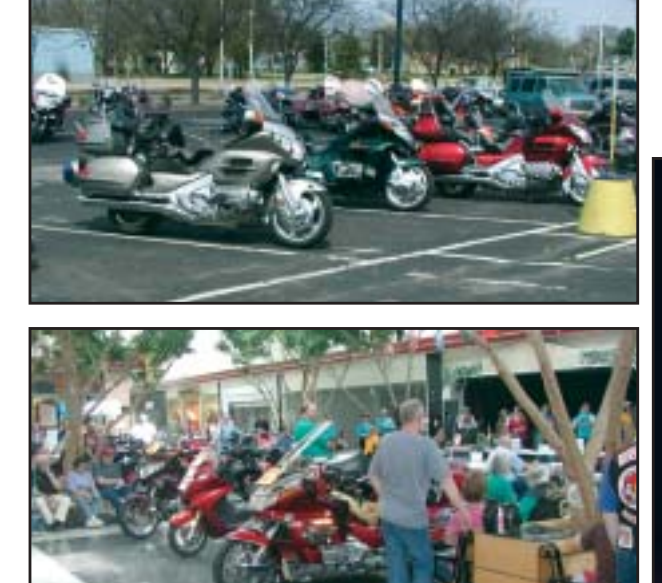
140+ people at Centerpoint Mall in St. Point, WI

For Our state web site www.gwrra-wi.org and the national site is www.gwrra.org