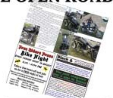
Free Riders Press Bike Nights