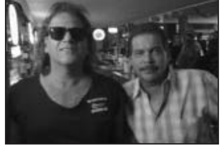
At JR's Broken Inn