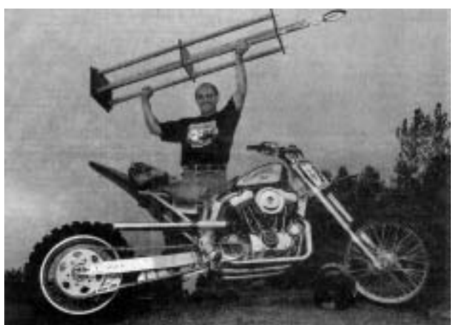
Winner of the 2003American Motorcycle Association

You can expect some great competition from all ages. From the minis (the younger competitors around 7 years old), where the kids can't even touch the ground to the open class were it is balls to