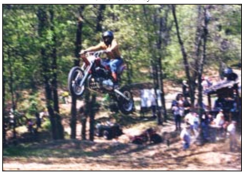
The correct way to hill climb!