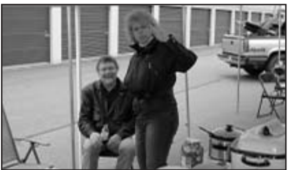
Lots of food was available