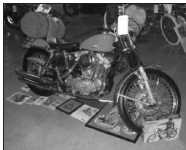
> Antique Motorcycle Club of America showcased the bike in Davenport.