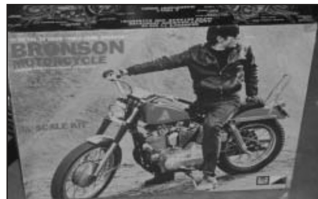
MPC released a 1:8 scale model of the bike.