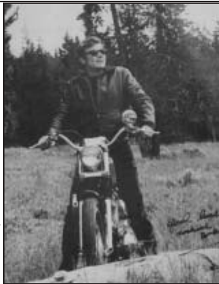
Actor Michael Parks starred as on-the-roader Jim Bronson.

In the series, Bronson actually buys back the bike that he once owned, from his friend's widow and then travels south, toward Big Sur, looking for the meaning of life. Along the way he has his share of excitement and adventures.