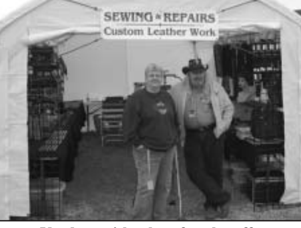
Vendors with a lot of cool stuff