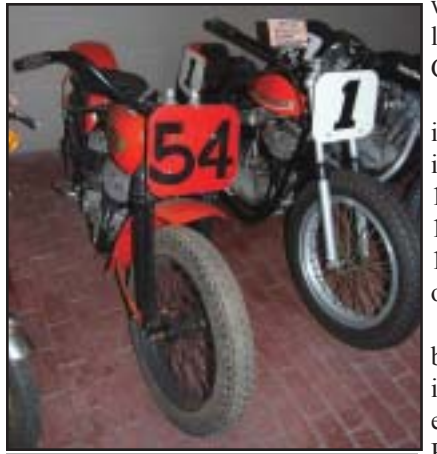
Racing bikes of various vintages are also displayed in the Barb City Motorcycle Museum.