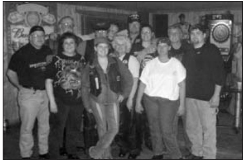
"Friends of Veterans"