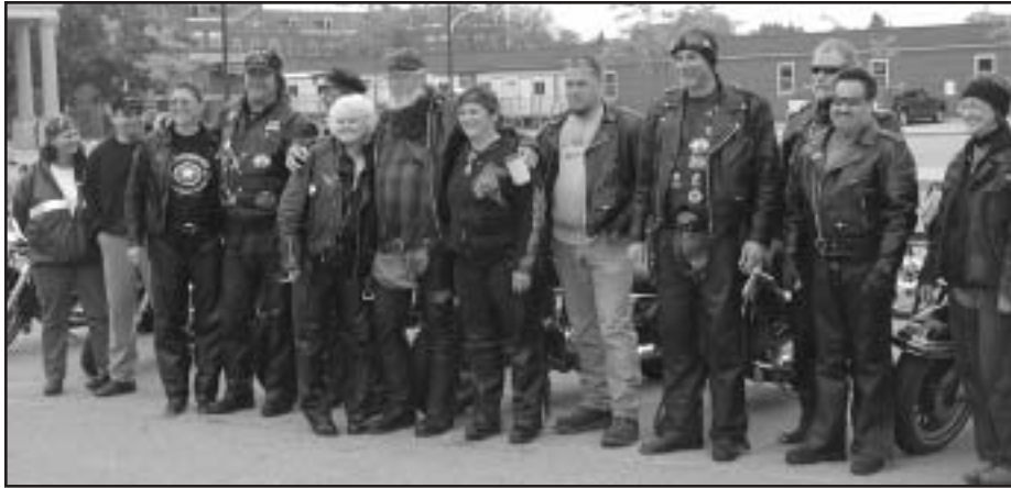
Some of the riders in Tomah