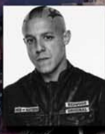
THEO ROSSI (JUICE)