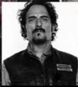
KIM COATES (TIG)