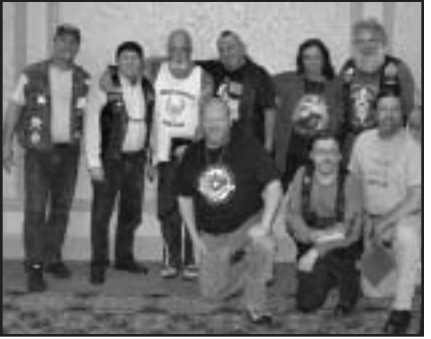
Legislative Task Force