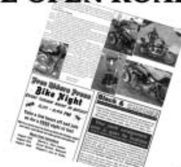
Free Riders Press Bike Nights