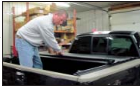
Servicing what we sell...