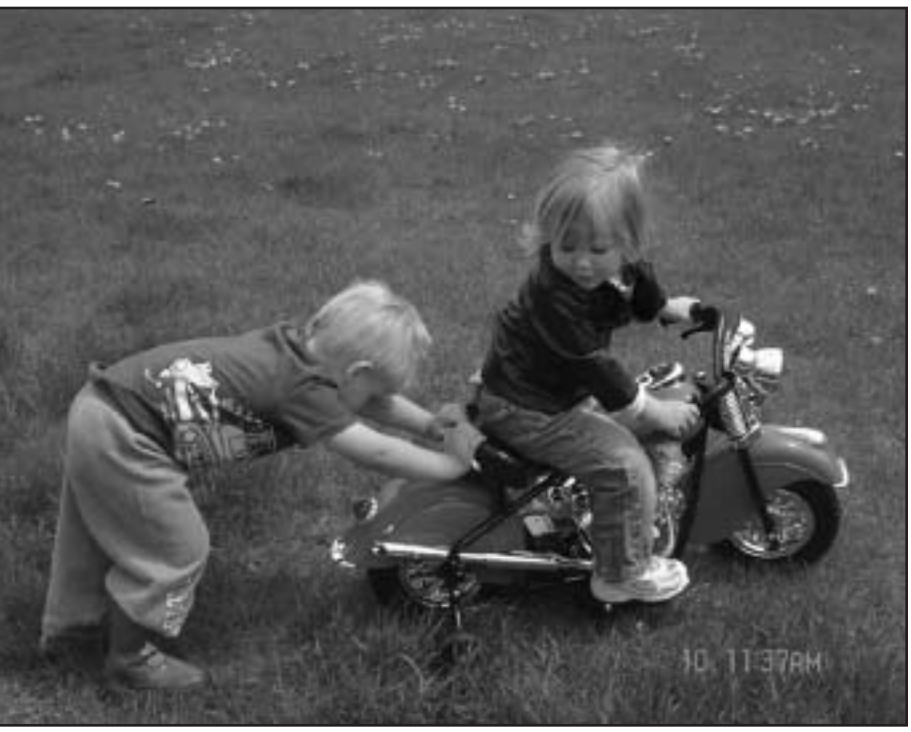
" Just let the clutch out slow , I've seen Grandpa do it a million times I'm sure they'll be sneakin' Grandpa's Chief outa the garage in a couple a years.

If you have a picture of your Next Generation Rider, feel free to send it in to me. Who knows it just might kick start a Hollywood career for them. Send those pic's to preacher@freeriderspress.us or by snail mail to 4500 Hwy 66, Stevens Point, WI 54481