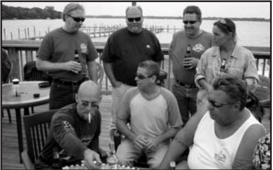
"Poker run at Knuckleheads in Fox Lake, IL"