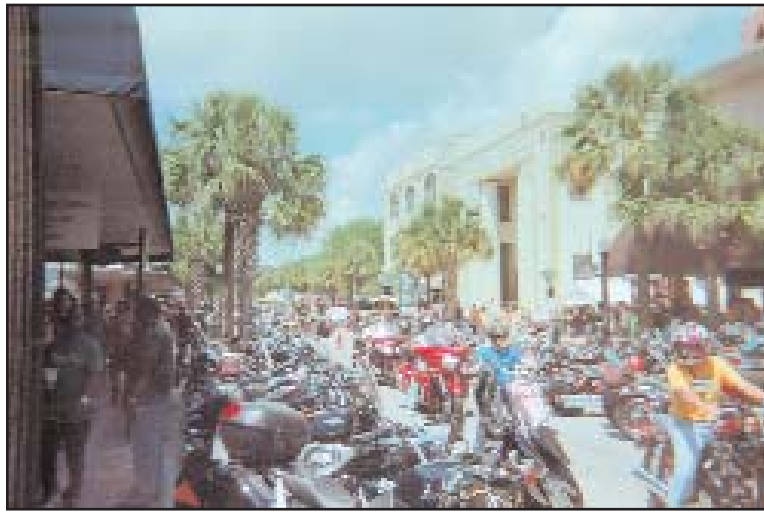
Just a few of the estimated 110 thousand bikes in the motorcycle only 30 square blocks of downtown Leesburg, Fla in 2014

Q: How do you embarrass an archeologist? A: Give him a used tampon and ask him what period it came from. Ride Fast, Hard, but Safe "Bone-Leg-Dog"