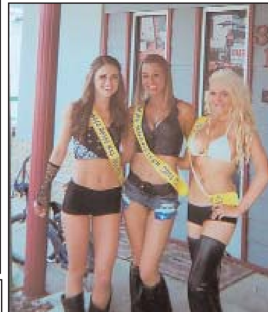
Miss Budweiser 2014 Miss Store Bought Ta-Ta's Lifetime Miss Thunder Roads Magazine 2014