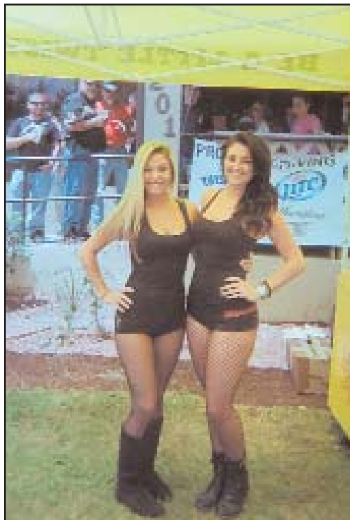
Miss Jaegermeister 2014 & Miss Twisted Tea 2014