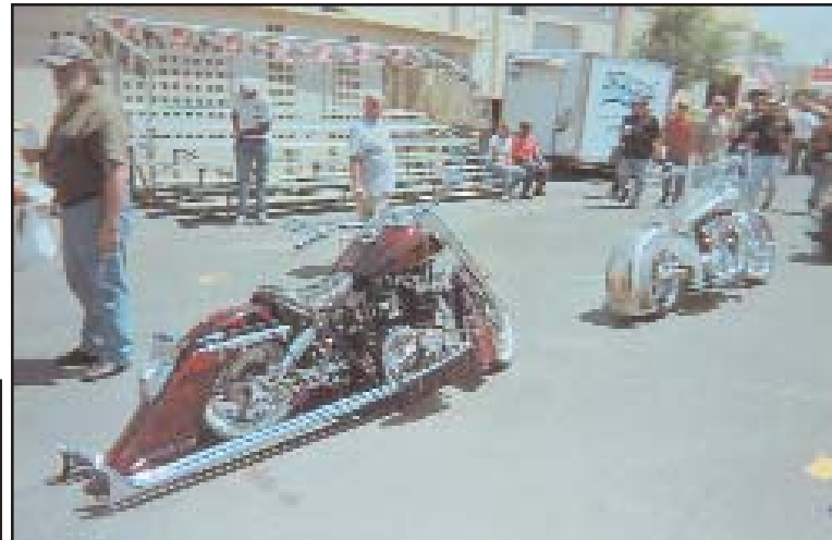
RicE Yes but Nice