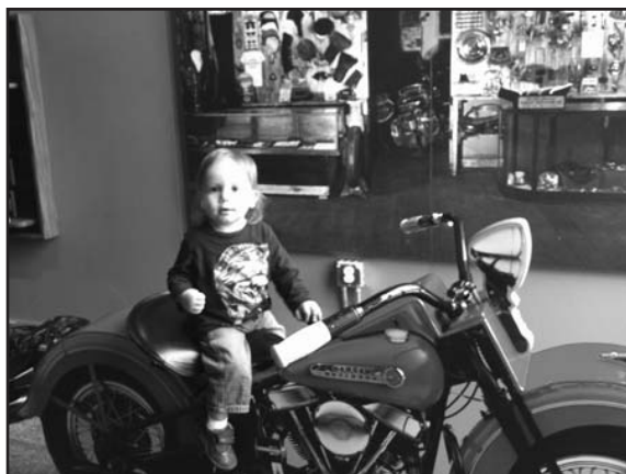
Thanks to everyone that sent in their pride and joys for the Next Generation section. Hope you all enjoyed for the scrapbook.