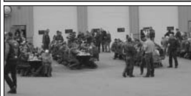
A great BBQ at Stratford Fire Dept.