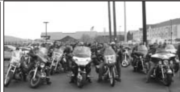
Lined up for the Ride