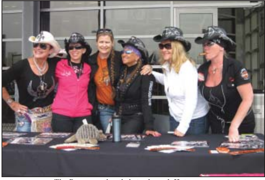
The Posse sporting their trademark Hats...

off to get a well deserved massage at one of the vendors booths. I'm sure the other 3 weren't far behind.)