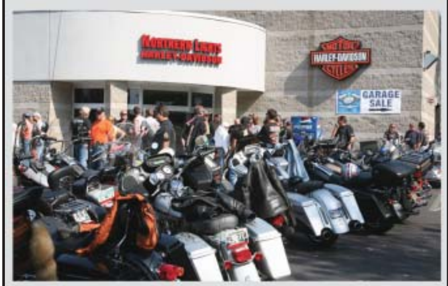
September 17th & 18th. Official Fun Run Stop. Closest GENUINE Dealer to Tomahawk!

FREE LUNCH Fri & Sat (while it lasts) Shop our garage Sept 16,17,18 for discontinued, obsolete, and end of season items. Check out our freshly stocked main store, or browse among our vendors (Kury-Akyn, Heat Demons, MKS Upholstery, Hog-ees,...) Look over the new 2011 models, a few 2010's and a great selection of used motorcycles. Bring your title, we take trades! No time to make it to Arbor Vitae? Shop one of our remote locations at Sara Park or Bubba's Big Party. Fall Ride hours Mon, Tue 9-8, Wed 9-8, Th, Fri 9-7, Sat 9-5, Sun 10-2. Located 4.5 miles north of downtown Minocqua on Highway 51 or 25 miles north of Bubba's.