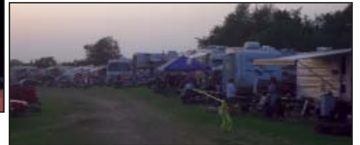
Plenty of Camping, Vendors, and Scenery