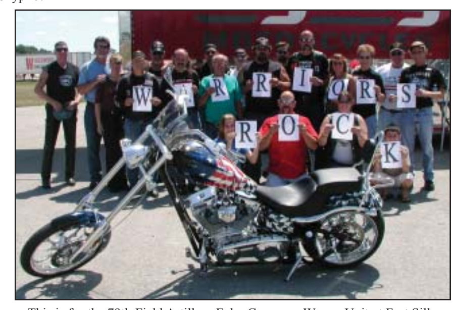
This is for the 79th Field Artillary Echo Company Warror Unit at Fort Sill, Oklahoma. Go warriors YOU ROCK!

Well until next month "KEEP ON TRIKEING", be safe on the highways and my the "GREAT SPIRIT" ride at your side. As always I ask that you pray for our POW~MIA, their families who wait and all our TROOPS deployed for a quick and safe return. God Bless The USA! Skypilot