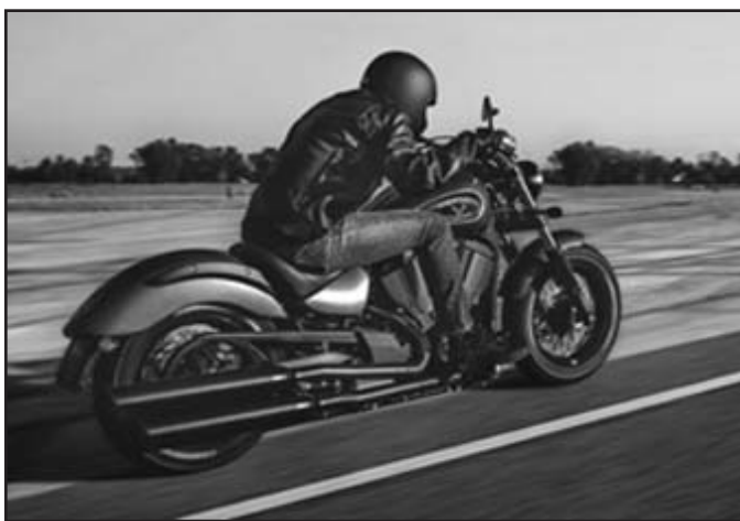
Riding the new 1731cc "stripper" motorcycle should be a real blast.

When I got home I did find Pre-reveal teaser photos of the Gunner on the Internet of course. There are no secrets