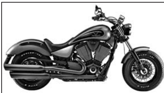
Black is the dominant hue on the Gunner, though you can get a red seat.