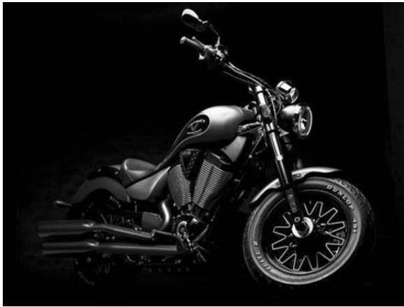
The 2015 Gunner promises to be a bare bones bobber with a big buzzer.