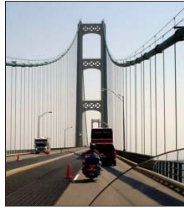
The Mackinaw Bridge

Feel free to send me any of your rides and I will do my best to get it in the FRP. Send to <u>preacher@freeriderspress.us</u>