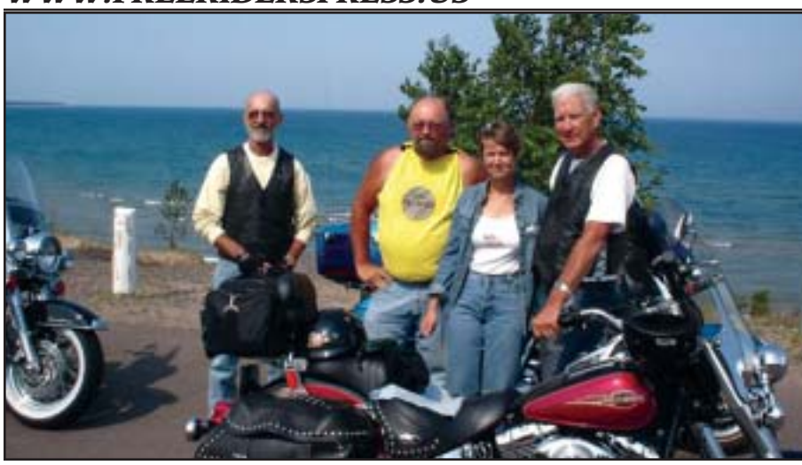
South shore of Superior