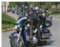
2007 RIDE - 1000 BIKES $54,000 RAISED