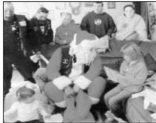
Black Pistons of Waushara County

Black Pistons of Waushara County adopted a family for X-mas. We contacted our local social services and got the name of a needy family. They were supplied with a full X-mas dinner, $50 gift card to our local grocery store and presents for all. Complete with Santa in all his glory. But lets not stop there. For Valentines Day our little girls got Angel bears with hearts of candy and grandma got her favorite chocolates. Were hoping to make a heartfelt difference to our family all year round. With B-days and all holidays. This has been a very rewarding project for all of us. Maybe this would be something your club/group would enjoy. I know we sure have!