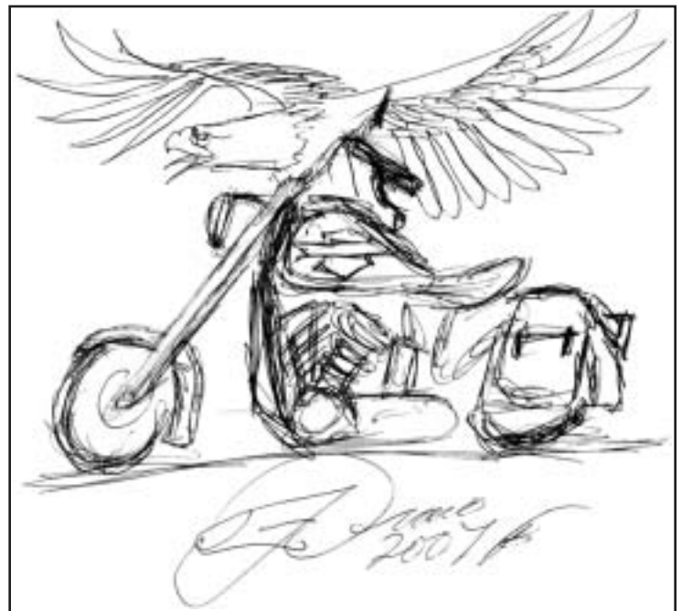
Not bad for someone that's blindfolded!!

The Magneto's Valentine's Day Dance was a smashing success! Over 250 people showed up and there was at LEAST 12 different club represented by members. The 'RYDERS' played some good music and the beer was plentiful. Bingo had a flat tire in the parking lot but the good brothers had him sit and wait where it was warm while they changed it for him. Bingo says THANKS to those good brothers! Bingo