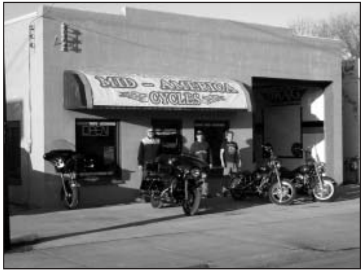
We look forward to seeing you soon. Ride Safe!