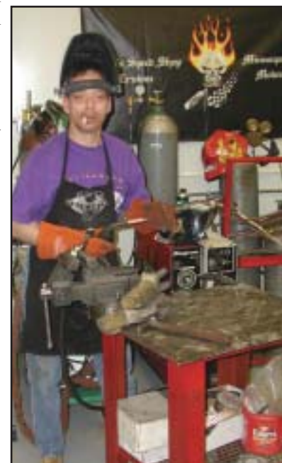
"Mechanic from Hell"

Lucky's Garage (right next to Whiskey Junction and The Joint) 815 Cedar Ave South Minneapolis, MN 55404 612-332-5825 www.luckys-garage.com