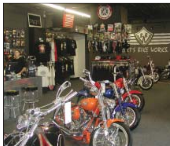
Plenty of storage